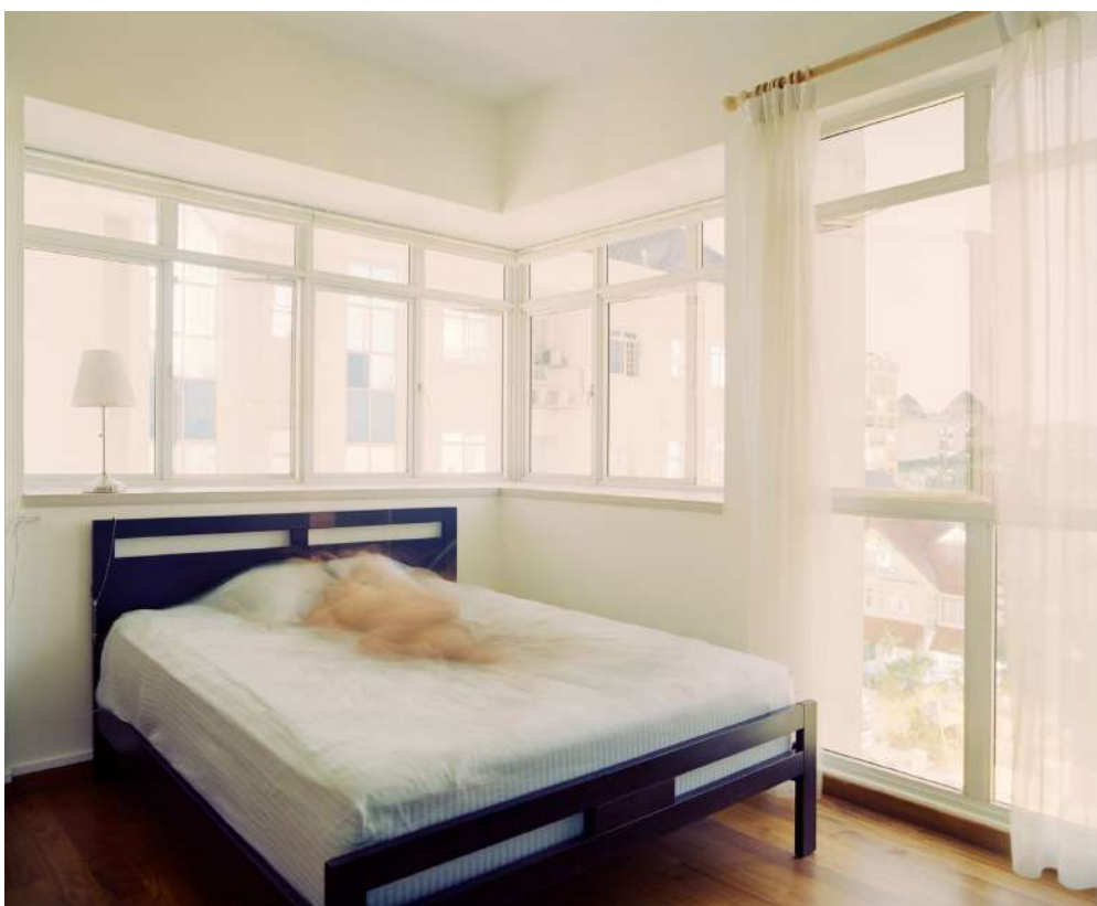
Unconsciousness : Consciousness #4 2012 archival fine art inkjet print 100 x 122.8 cm