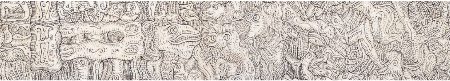
Made Wianta, The Soul of The Trees (detail)

MADE WIANTA (b. 1949, Bali, Indonesia) graduated from the Indonesia Institute of Arts (ISI), Yogyakarta, Indonesia in 1974. He is one of the most important figures in Balinese contemporary art and is one of the most prominent Indonesian abstract artists. Some of his exhibitions include Beyond the Myths: Art Bali at AB•BC Building, Bali Collection, Bali, Indonesia (2018); Run For Manhattan at Ciptadana Art Space, Jakarta, Indonesia (2017); and After Utopia: Revisiting the Ideal in Asian Contemporary Art at Singapore Art Museum, Singapore (2015). Wianta was one of the artists at the Indonesian Pavilion of the Beijing International Art Biennale #7, National Art Museum of China, Beijing, China (2017). His works are in the collections of OHD Museum, Magelang, Indonesia; Museum der Kulturen, Basel, Switzerland; Rudana Art Museum, Ubud, Bali, Indonesia; Agung Rai Museum of Art, Ubud, Bali, Indonesia; National Gallery of Indonesia, Jakarta, Indonesia; Neka Art Museum, Ubud, Bali, Indonesia; Darwin Art Museum, Darwin, Australia; and Museum Bali, Denpasar, Bali, Indonesia amongst others. Made Wianta lives and works in Bali, Indonesia.