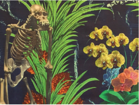
Budi Agung Kuswara, Summer Blooming (deep blue mirror series) (detail)