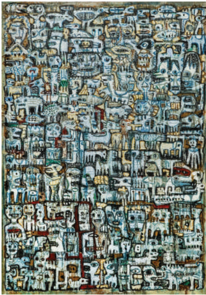
I Made Djirna Men and Beasts 2019 mixed media on canvas 200 x 140 cm

Bali's society has a unique characteristic where daily lives are still deeply centered on their religious belief, the Agama Tirtha or 'the Religion of the Holy Water'. Balinese Hinduism incorporates interpretations of Chinese, Indian, and Javanese beliefs. Balinese truly believe that they are trusted by God Sanghyang Widhi to take care of the land. As a result, they are deeply religious and make great efforts to appease the gods through processions, offerings, ceremonies, and many other religious activities. Hence, many disciplines of art are still alive in the daily lives of the people as a part of their religious activities. On the other hand, Bali is also an international tourist paradise and 'party' destination, where hotels, resorts, villas, clubs, beach clubs, and