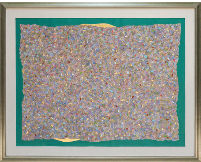
Made Wianta Jade Mosaic 2005 oil and acrylic on canvas 90 x 120 cm (unframed) 111.5 x 140.5 x 2.5 cm (framed)

Similar sensibilities are also evident in the works of I Made Djirna presented in this exhibition, entitled Men and Beasts , Primitive Images , and Ceremony in Red . In all of these works, Djirna overcrowded his canvases with interlocking images of small figures and animals, although it does reminds me of Jean Dubuffet's works, but in