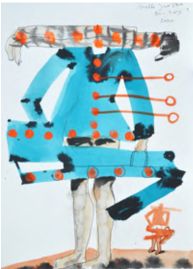
13 Mella Jaarsma No - Body 1 2020 gouache, pencil, ink on paper 42 x 30 cm