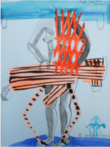
11 Mella Jaarsma Endless Dress 1 2020 gouache, pencil, ink, bamboo on paper 37 x 28 cm