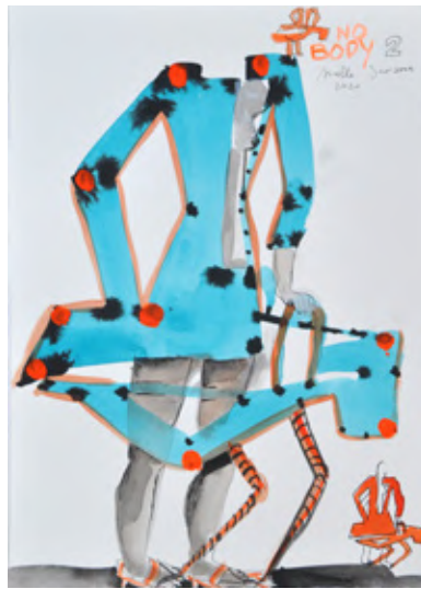
14 Mella Jaarsma No - Body 2 2020 gouache, pencil, ink on paper 42 x 30 cm