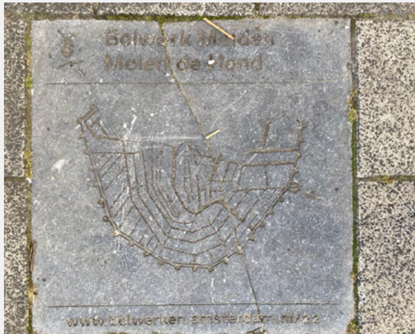
A map of the walls of Amsterdam showing the location of 26 bastions, on top of which windmills were placed.

person documented, he had to be in constant conversation with both his cameraman and sound person and together negotiate the visual and audio variations, in situ. Each decision of completion was attributed to all three reaching " titik yang enak " (the good point), including enjoying an impromptu jamming session with a tram conductor before recording the beating of the tram rail.