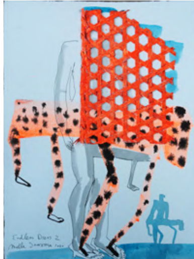
12 Mella Jaarsma Endless Dress 2 2020 gouache, pencil, ink, bamboo on paper 37 x 28 cm