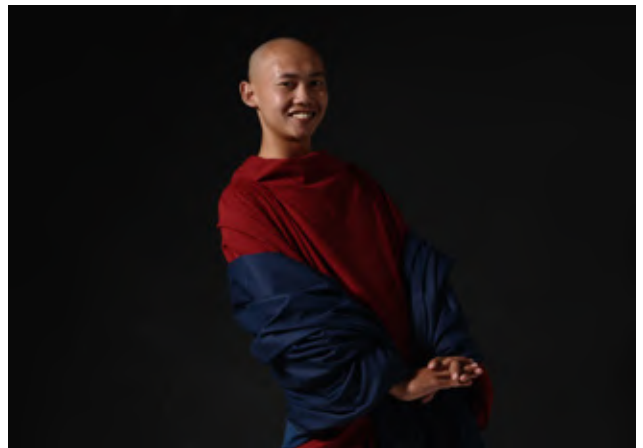
Agan Harahap Supper at Emmaus 2020 digital C-print on photo paper 33 x 50 cm edition of 3 + 1AP