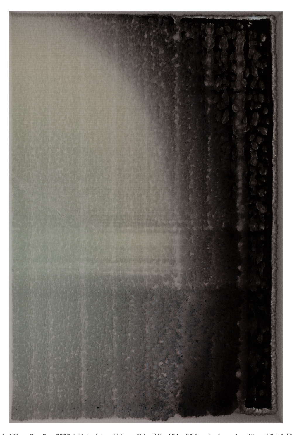
Liu Liling , Sea Fog, 2023, inkjet print on Hahnemühle, dilite, 124 × 82.5 cm (unframed), edition of 3 + 1 AP