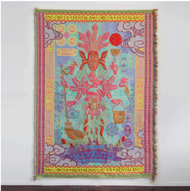
Marcos Kueh , Woven Poster #10 - Homo Servantis Erotis (Ready to Serve) , 2023, industrial weaving, recycled PET, 8 colours, 235 × 170 cm, Edition of 3 plus 2 artist's proof © Marcos Kueh, courtesy of The Back Room and Mizuma Gallery