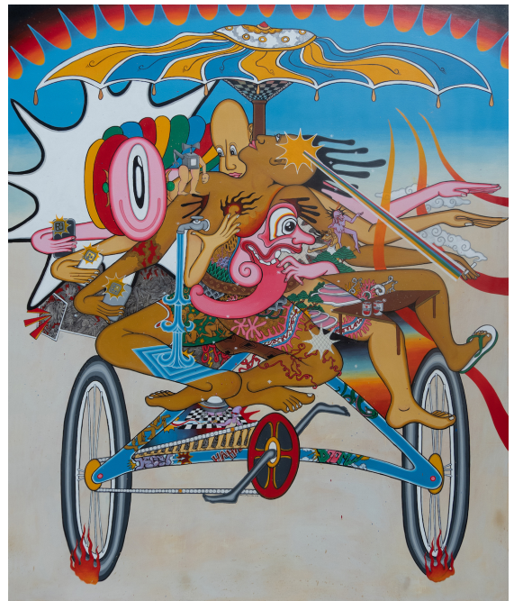
Kuncir Sathya Viku , LSD , 2024, acrylic on canvas, 180 × 150 cm © Kuncir Sathya Viku, courtesy of the artist and Mizuma Gallery.