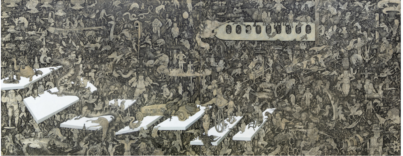
I Nyoman Arisana , Perjalanan , 2024, ink, acrylic on canvas, 140 × 360 cm (diptych, 140 × 180 cm each) © I Nyoman Arisana, courtesy of the artist and Mizuma Gallery.