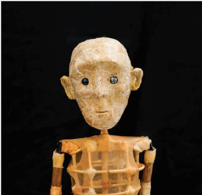
The Visitor #9