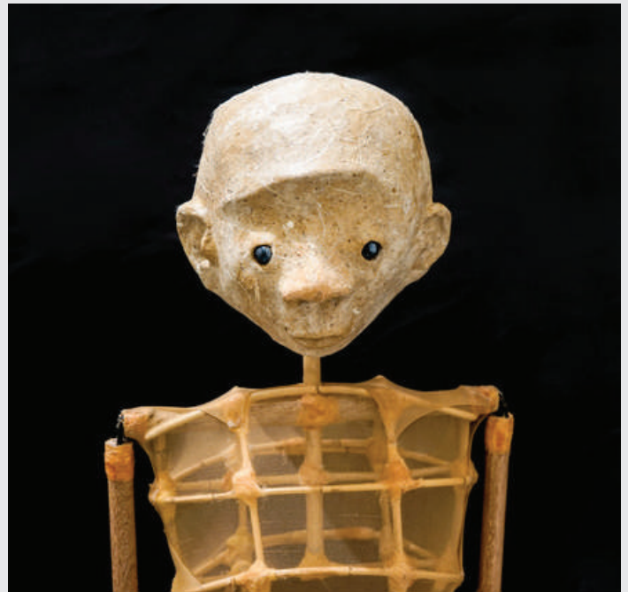
The Visitor #12